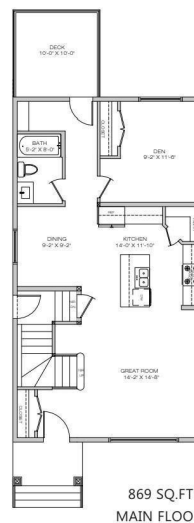
869 SQ.FT. MAIN FLOOR